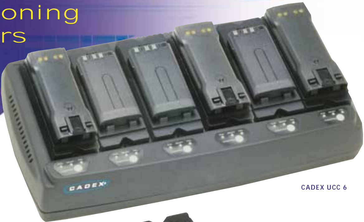
CADEX UCC 6

Cadex Electronics Inc., 22000 Fraserwood Way, Richmond, BC Canada V6W 1J6 Tel: +1 604 231-7777 Fax: +1 604 231-7755 info@cadex.com www.cadex.com