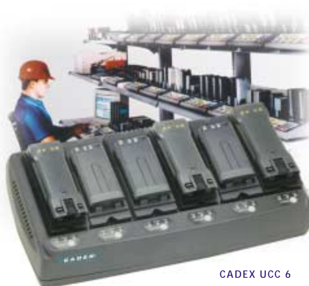
CADEX UCC 6