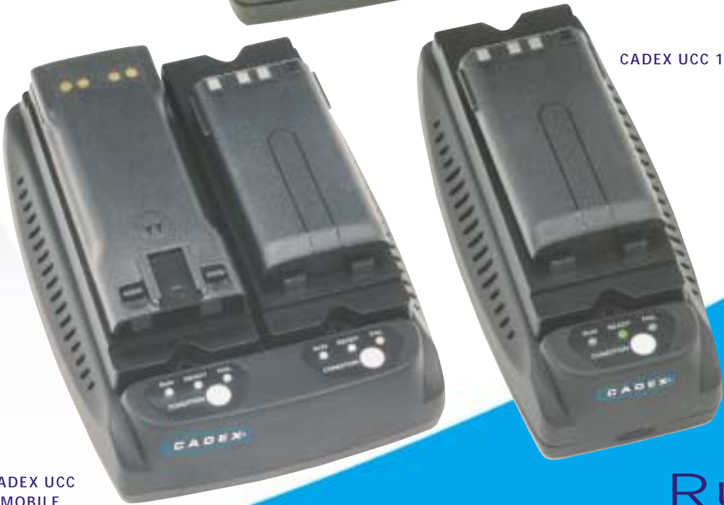
CADEX UCC 1