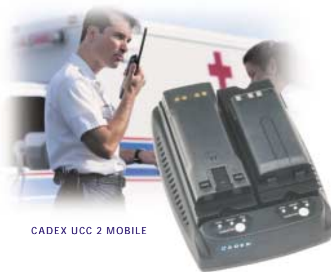
CADEX UCC 2 MOBILE