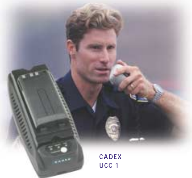
CADEX UCC 1

— Strong, hard wearing Cadex units are designed on a Universal platform to service Lithium Ion/Polymer, Nickel Cadmium and Nickel Metal Hydride batteries. Whether it's in the office, or mounted in a mobile unit, Cadex Universal Chargers offer dependable energy in any environment.